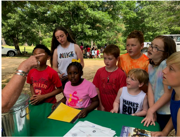
Keep Crystal Spring Park and Recreation Summer Field Day, where KMB was a presenter.

KMB staff/certified trainers conducted Waste in Place Teacher Workshops where teachers receive CEUs. Workshops hosted by the Mississippi Soil and Water Conservation Commission were held in Lamar and Yazoo Counties. Keep America Beautiful provided in-kind education materials valued at $3,250 for the workshop attendees. Educators attending these workshops are given Keep America Beautiful's Waste in Place curriculum guide with hands-on lesson plans to take back to their classrooms. Lesson plans are taught on litter prevention, beautification, community greening, recycling and an integrated approach to solid waste management. KMB staff reminds educators on the estimated cost the MDOT spends on litter removal on state maintained highways and that they may call the MDOT Litter Prevention Coordinator in their district for classroom presentations.