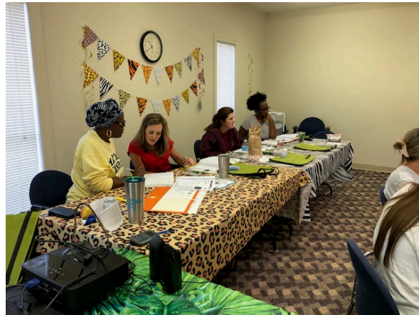
KMB participates in teacher workshops during the summer.

KMB staff and MDOT Litter Coordinators work jointly with school field day events where a session is shared giving educational presentations on litter prevention, beautification and recycling. KMB attended Crystal Springs Park and Recreation Field day, and the district MDOT litter coordinator had a station at the event as well. Students learned about litter prevention and recycling from our two groups. Over 125 children attended the event.